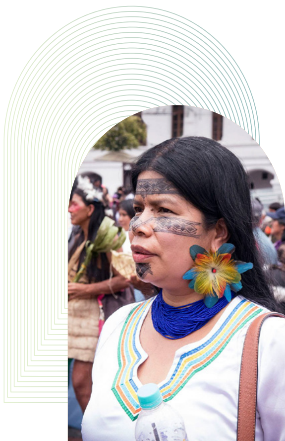
Mujeres Amazónicas Defensoras de la Selva

Despite the crucial role of feminist movements and organisations in advancing climate justice and progress towards multiple development goals, 18 according to OECD data, women's rights organisations received just USD $547 million in 2020-2021, around 1% of total ODA dedicated to gender equality and women's empowerment. 19 While literature on the gender equality and environment intersection does identify the need to engage and support feminist movements and organisations, including local CSOs, Indigenous peoples and local communities, 20 still only 0.22% of climate-related ODA went to women's rights organisations in 2018-2019. 21 Likewise, of the total amount of philanthropic giving estimated to be allocated to climate related issues, only 3% directly supports women's environmental activism. 22