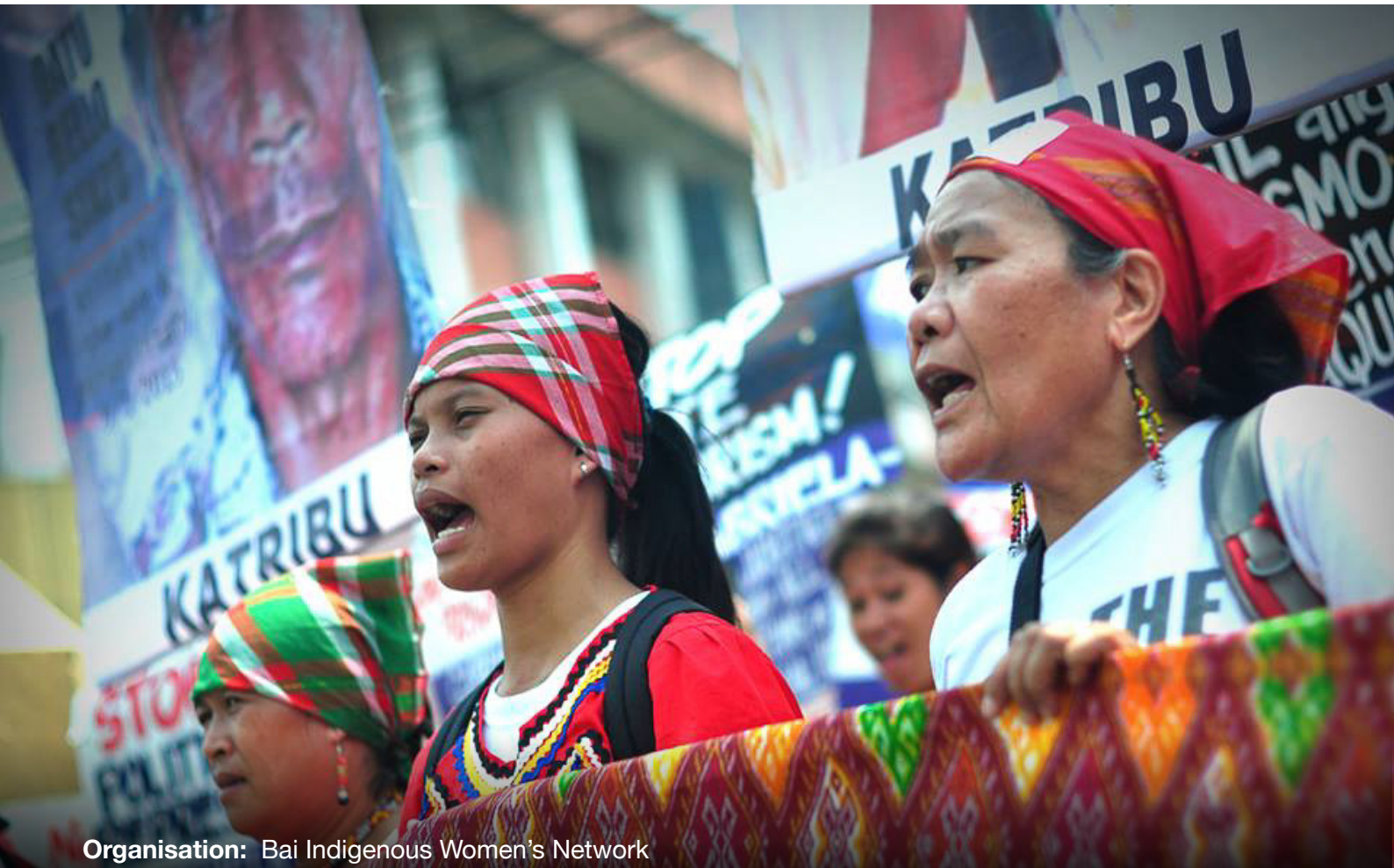
Organisation: Bai Indigenous Women's Network

WEDO: Women's Environment Development Organization