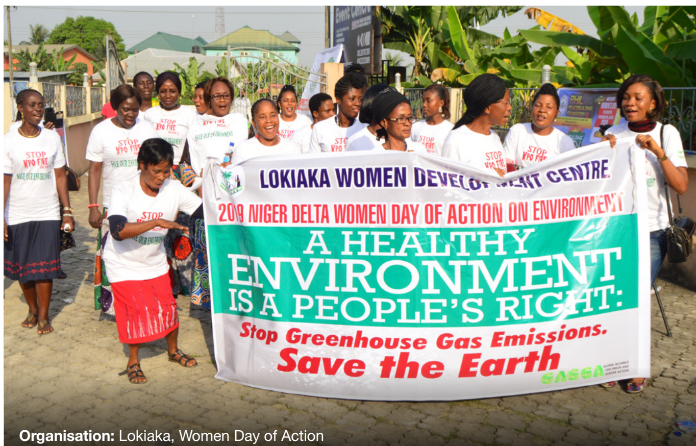
Organisation: Lokiaka, Women Day of Action

Moreover, women's funds are key to mitigating risk as traditionally defined by donors, as well as the more fulsome understanding of risk, with the experience and resources to meet donor risk requirements. A portfolio approach to funding a variety of organisations allows feminist funds to balance risk across the portfolio, as well as maintaining a principle of trust with their partners. As they are embedded in the movements they serve, women's funds also have the tools, networks and knowledge of local contexts to help protect activists' safety and security and better respond to the needs of their partners. Finally, women's funds have the ability to flow a large amount of total funding to many smaller organisations, with outsize impacts, recognising the benefits of supporting a range of feminist movements to advance gender, social, racial and climate justice. There is further work to be done to document the strategies and impact of feminist organisations in delivering on climate action. With adequate resources, women's funds can fulfil their potential in showcasing the impact of the movements and organisations they support, sharing lessons and strategies for success.