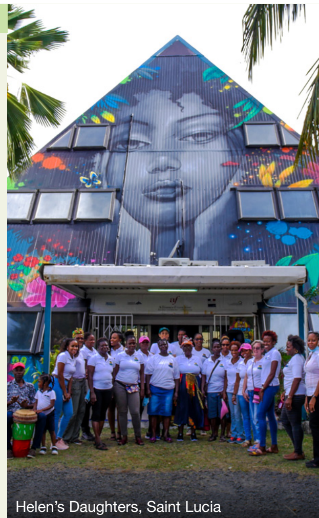
Helen's Daughters, Saint Lucia

This women's rights organisation takes a multi-issue approach that recognises and addresses the complex dynamics of gender, climate justice, and agriculture. Its holistic programmes include education (training programs, scholarships, apprenticeships), farmer supports (subsidies, market access), and health and wellness (rural health clinics, medical insurance). One of Helen's Daughters' most profound impacts is redefining what it means to be a woman in the agricultural field, starting with women farmers' view of themselves. It has sparked a transformation from women feeling invisible to recognising their important role in strengthening Saint Lucia's food security.