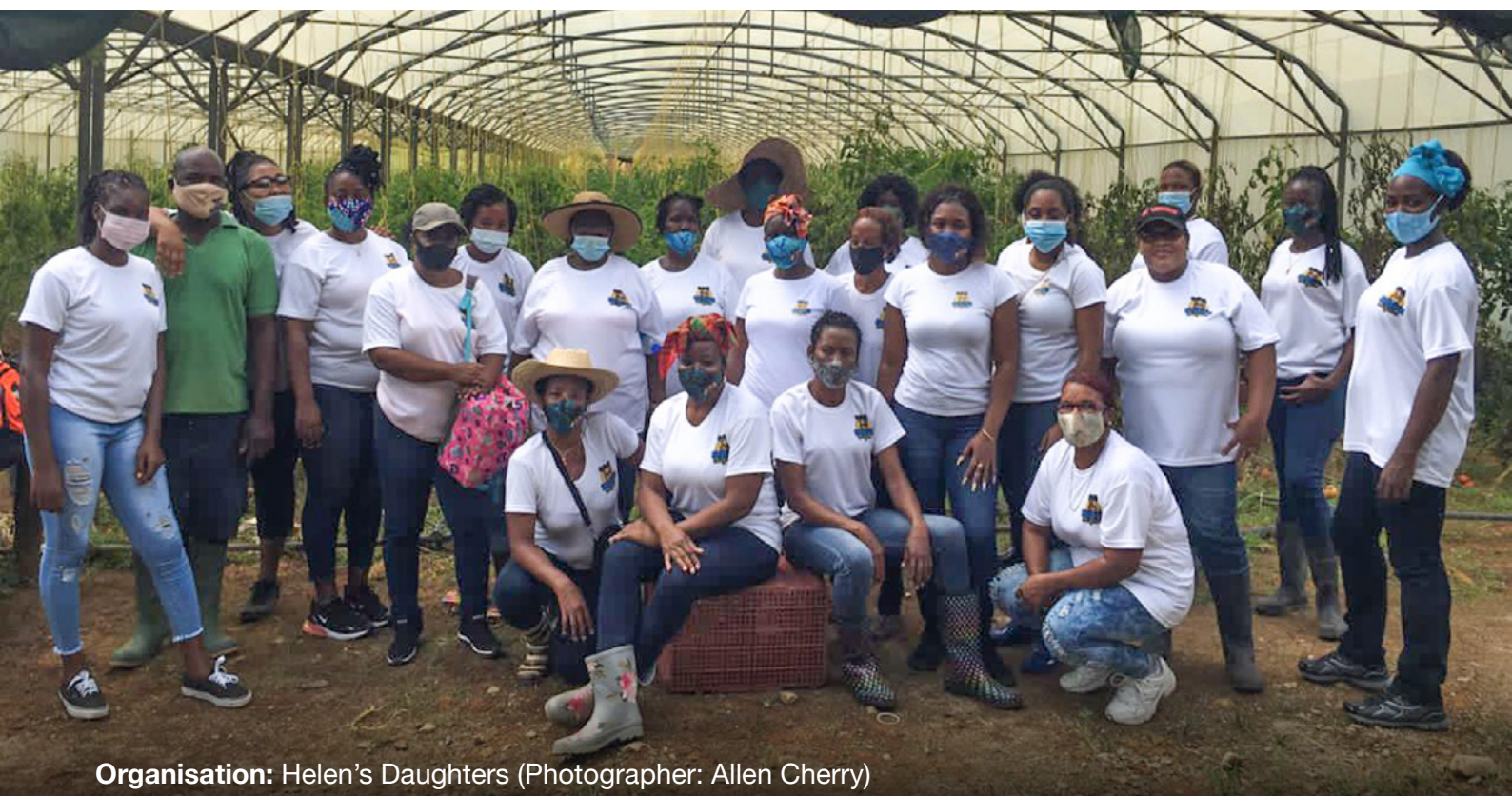
Organisation: Helen's Daughters (Photographer: Allen Cherry)

Moreover, the majority of climate finance (57%) is distributed in the form of loans rather than grants, reinforcing regional inequalities and colonial legacies by increasing the burden of debt on countries already disproportionately affected by climate change. 12 Mechanisms for accessing climate finance are often slow, complex, resource intensive, and project-based, with an overall lack of transparency and few grants-based mechanisms. 13 A new report by the OECD highlights how these barriers and systemic inequality prevent local civil society organisations from obtaining the resources needed to carry out their work, with limited and irregular financing reaching this level. 14