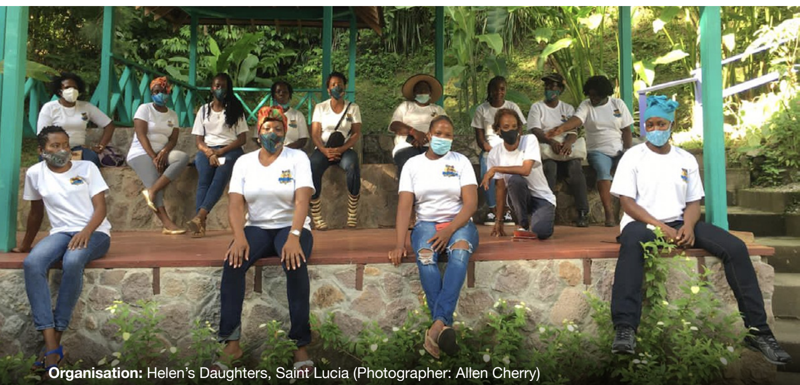
Organisation: Helen's Daughters, Saint Lucia

Much of this work has been well-documented in the literature on gender-just climate solutions, a term that describes the rights-based, bottom-up and people-centred approaches that put gender justice and democracy at the centre of climate action, and therefore seek to address the root causes of climate injustice. As explained by WEDO in their Feminist Agenda for People and Planet, the climate crisis is rooted in ideologies that embrace a goal of infinite growth which—on a finite planet—can only happen through extraction, exploitation, and destruction. 2 By challenging existing power structures and tackling the root causes that lie behind the climate crisis, feminist movements challenge traditional notions of what climate action entails, contributing to broader changes in how our economies and societies operate. Crucially, these movements also take an intersectional approach, building inclusive, trust-based and resilient networks that centre the knowledge and perspectives of diverse community-led and structurally excluded groups.