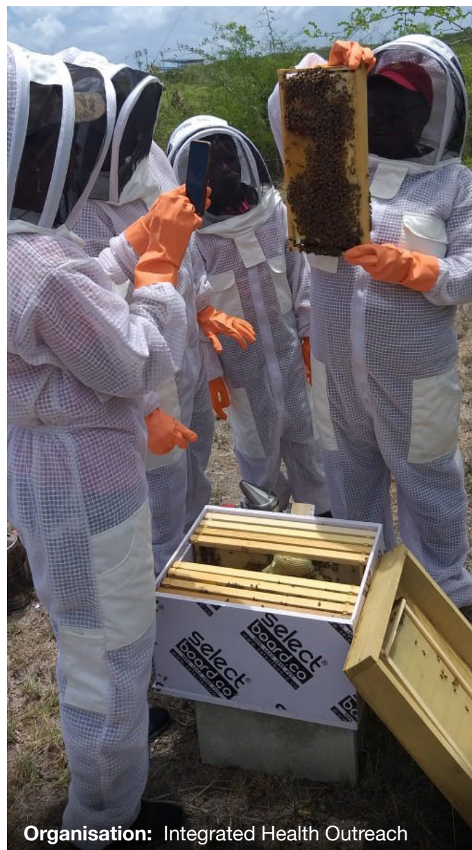
Organisation: Integrated Health Outreach

However, there is a much greater risk to advancing climate justice by failing to resource frontline struggles than in upholding current risk frameworks. This is because narrow definitions of risk overlook two more urgent and real risks. Firstly, the risk that an unjust status quo—the same one that produced the climate crisis—will be reinforced. Activists must be supported to challenge it. Secondly, feminist activists, particularly Indigenous women and women’s environmental and human rights defenders, carry out climate justice work at great personal risk, often facing severe retaliation and finding their health and safety under threat. Since 2012, 1,910 land and environmental defenders have been killed, 34% of whom were from Indigenous communities. 40 Despite these risks, they persist in their roles as leaders and movement builders, bringing critical perspectives to work on climate justice at the local, national, regional and international level. Donors have a responsibility to match the courage of these activists and fund from a frame of potential and opportunity.