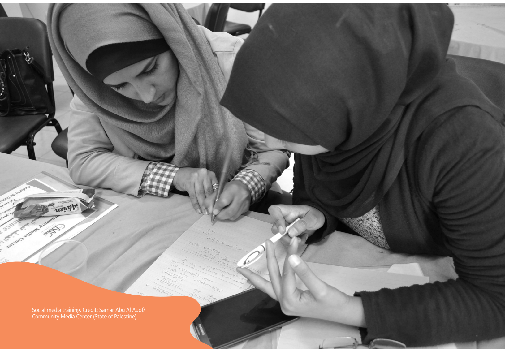
Social media training.