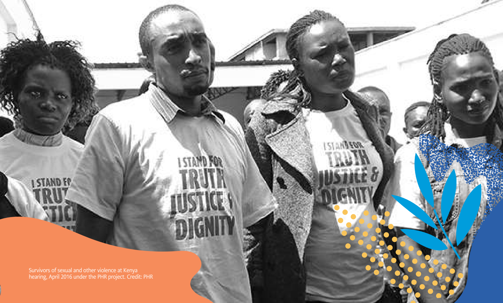
Survivors of sexual and other violence at Kenya hearing, April 2016 under the PHR project.

Initially, the trainers learned the concepts related to violence against women and gender issues and legal rights. They started to perceive violence and inequalities as unacceptable and changeable. They started changing their own attitudes and behaviours within family and towards their students. In company with the internalization of being equal and nonviolent, they reached the messages of [the] Father Support Programme to the fathers and the mothers. (AÇEV, final evaluation report, p. 2).