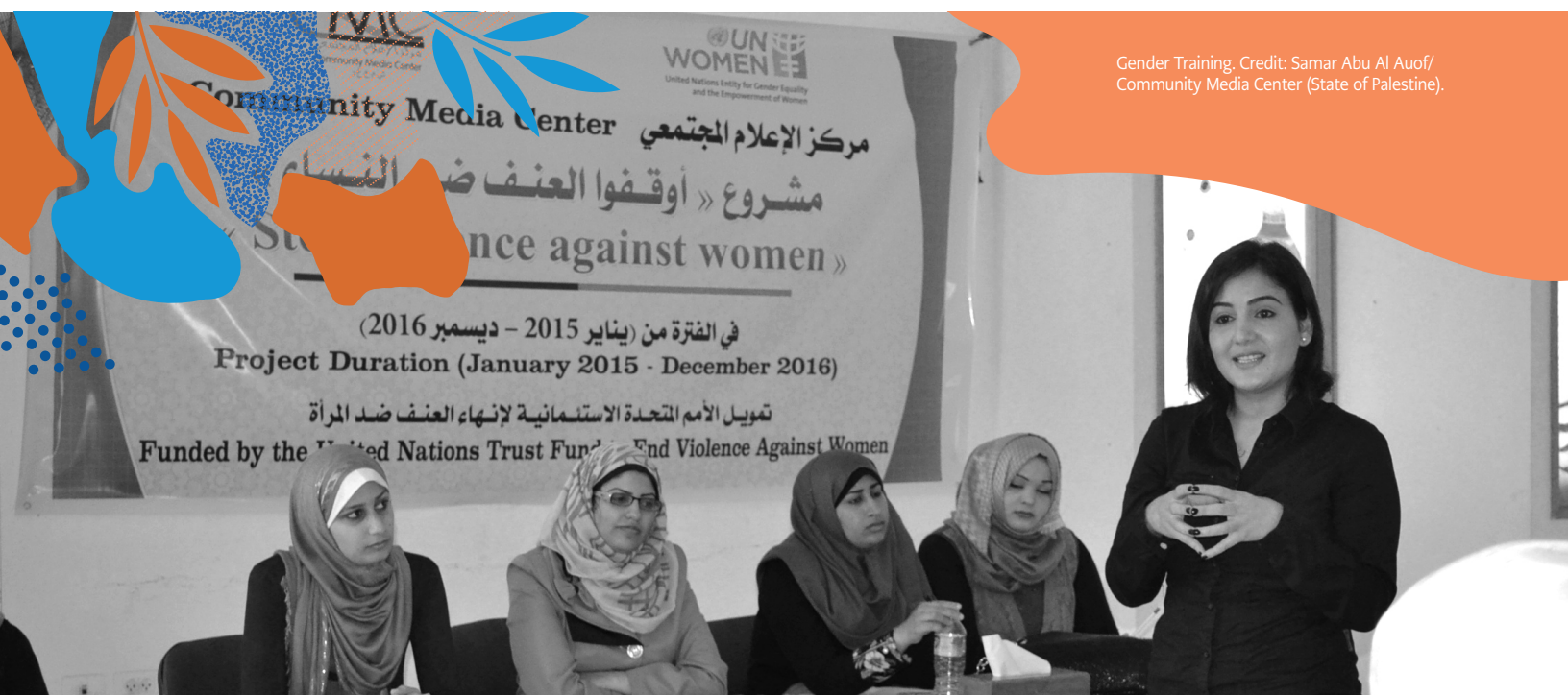
Gender Training.

While skills training can be carried out in a short time, for participants to address misconceptions, absorb new techniques and methods, and practice them in real life, an intensive, repetitive process was required in which skills were taught and continually reinforced. In PHR's case, the clinicians, the police and justice professionals had to master a vast amount of new information, highly skilled procedures and techniques, and unlearn certain practices that had become entrenched over time. There is always a limit to an individual's capacity to absorb information; the training was spaced out with enough time for participants to reflect, figure out what they had learned, apply it and return with questions on the practice or feedback. This loop was essential, particularly since PHR worked in resource-constrained contexts. Of course, the use of innovative and novel training techniques must be managed and adapted to local contexts. In many cases in Africa, there are patchy internet connections, poor connectivity and limited resources. From this, another important lesson emerged: skilled training does not have to be dependent on specific supplies, tools or resources; training is effective when it is adapted to the resources and limitations of local contexts.