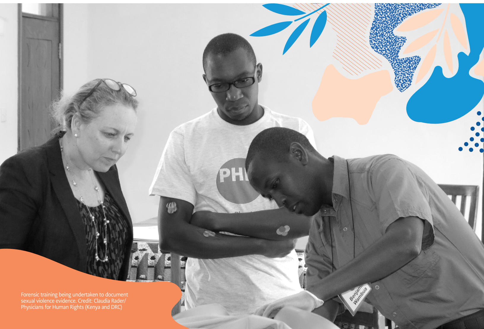
Forensic training being undertaken to document sexual violence evidence. (Kenya and DRC)

perspectives on training in focus group discussions. Therefore, it is the PBK that has guided the framework and structure of this review. A rich picture has emerged of certain facets of trainings across their lifecycle that have been strengthened and improved by practitioner experiences.