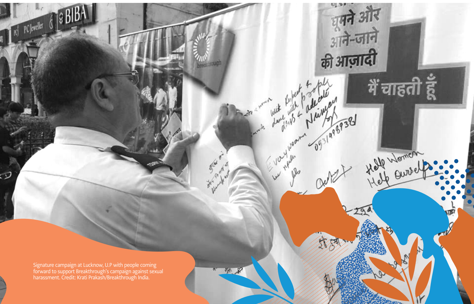
Signature campaign at Lucknow, U.P with people coming forward to support Breakthrough's campaign against sexual harassment.