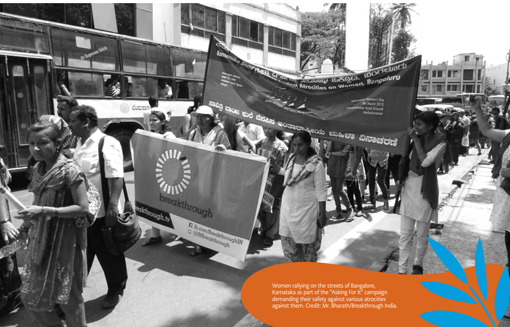
Women rallying on the streets of Bangalore, Karnataka as part of the "Asking For It" campaign demanding their safety against various atrocities against them.