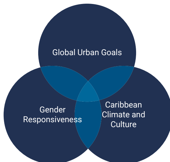
Figure 1. The intersecting contexts of the RISS Cities Model

The initial research was a desk-based study, which drew largely on publicly available documents and reports, government websites, academic articles and other resources such as the Her City Toolbox. A working paper was drafted to be further informed and developed through consultations with urban and gender development specialists from the public and private sectors, non-government organizations, academia and other sources. The core premise of the Model is the intersection of three contexts: the global goals and related urban agenda; improved social inclusion related to gender and other vulnerable groups; and the realities of Caribbean SIDS, as illustrated in Figure 1. This initial draft of the Caribbean RISS Cities Model was then reviewed in five national consultations and one regional one; the Model will be updated based on this feedback for further validation in a regional consultation prior to the finalization. The detailed country notes for each of the five countries consulted will be included in the final report. The countries included for consultation at this stage are The Bahamas, Belize, Jamaica, Saint Lucia, and Trinidad and Tobago.