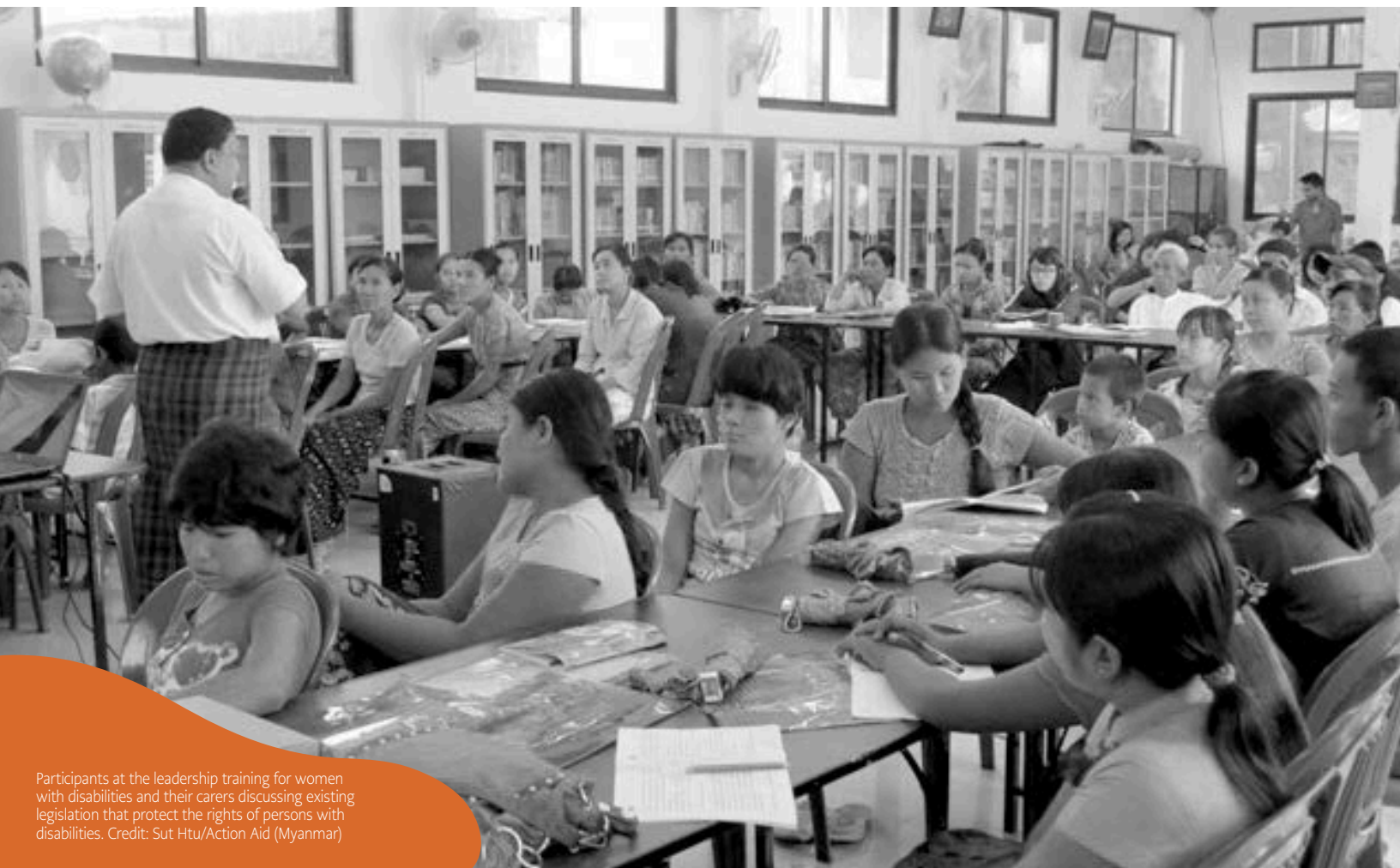
Participants at the leadership training for women with disabilities and their carers discussing existing legislation that protect the rights of persons with disabilities.