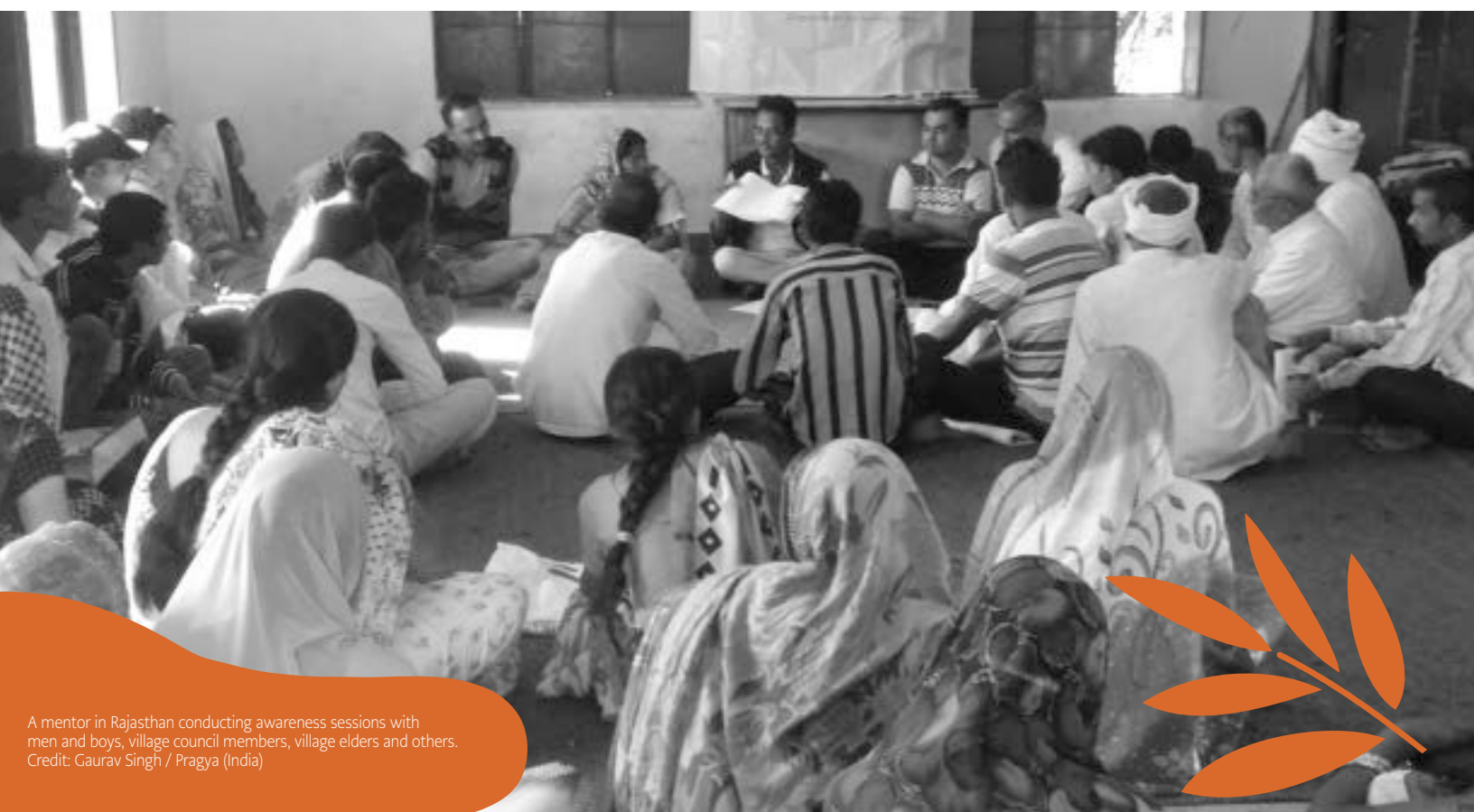
A mentor in Rajasthan conducting awareness sessions with men and boys, village council members, village elders and others.

The issue of whether formal or informal justice systems should preside over VAWG cases was raised by CSOs as one they had to work on in collaboration with community leaders but also in partnership with formal law enforcement personnel to agree on what the process should be depending on the type of case. This approach was identified as effective by LCDZ in Zimbabwe, which carried out awareness-raising at community level in collaboration with formal legal actors: