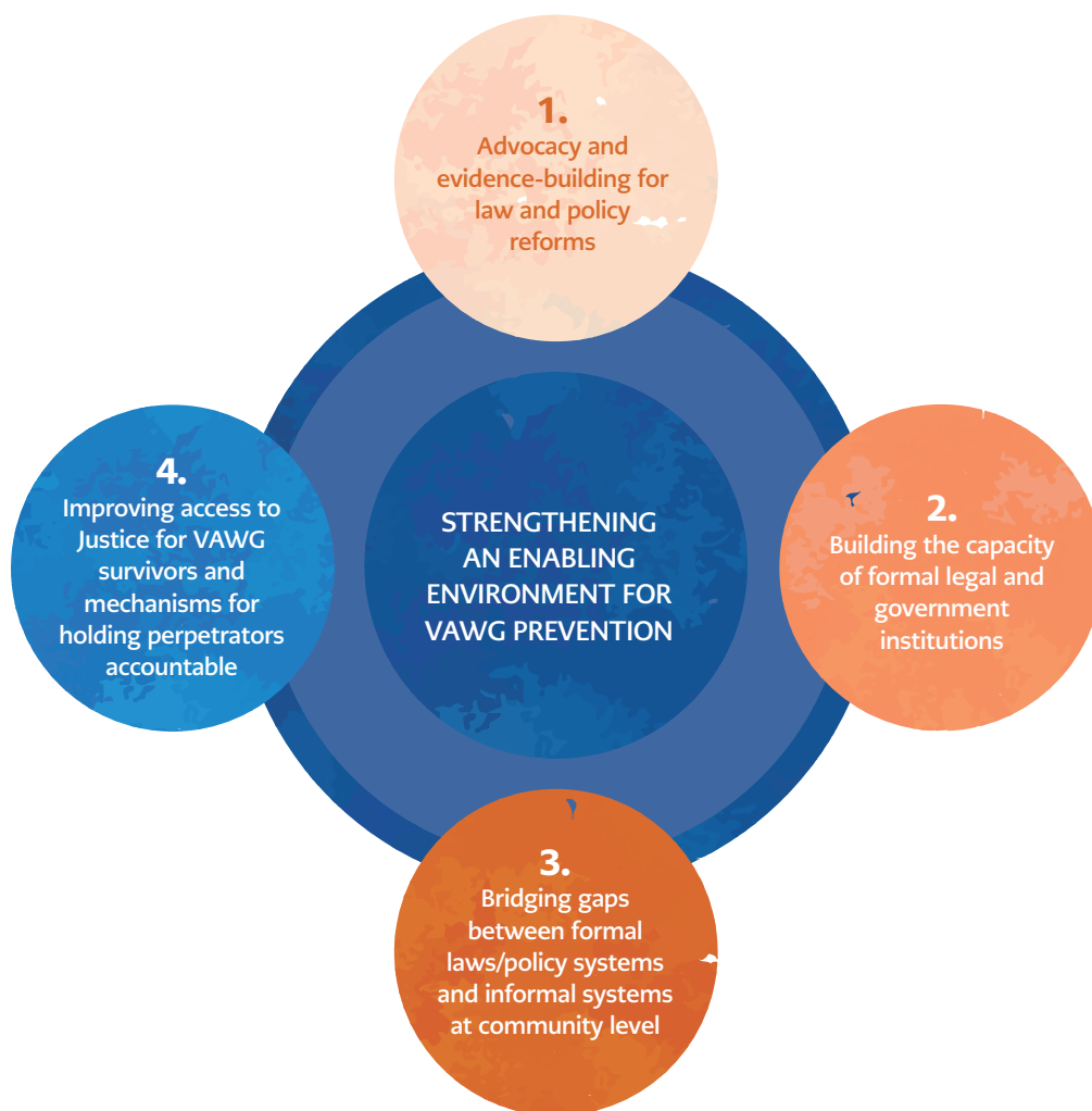
FIGURE 2: Strengthening an enabling environment for VAWG prevention – entry points for civil society engagement