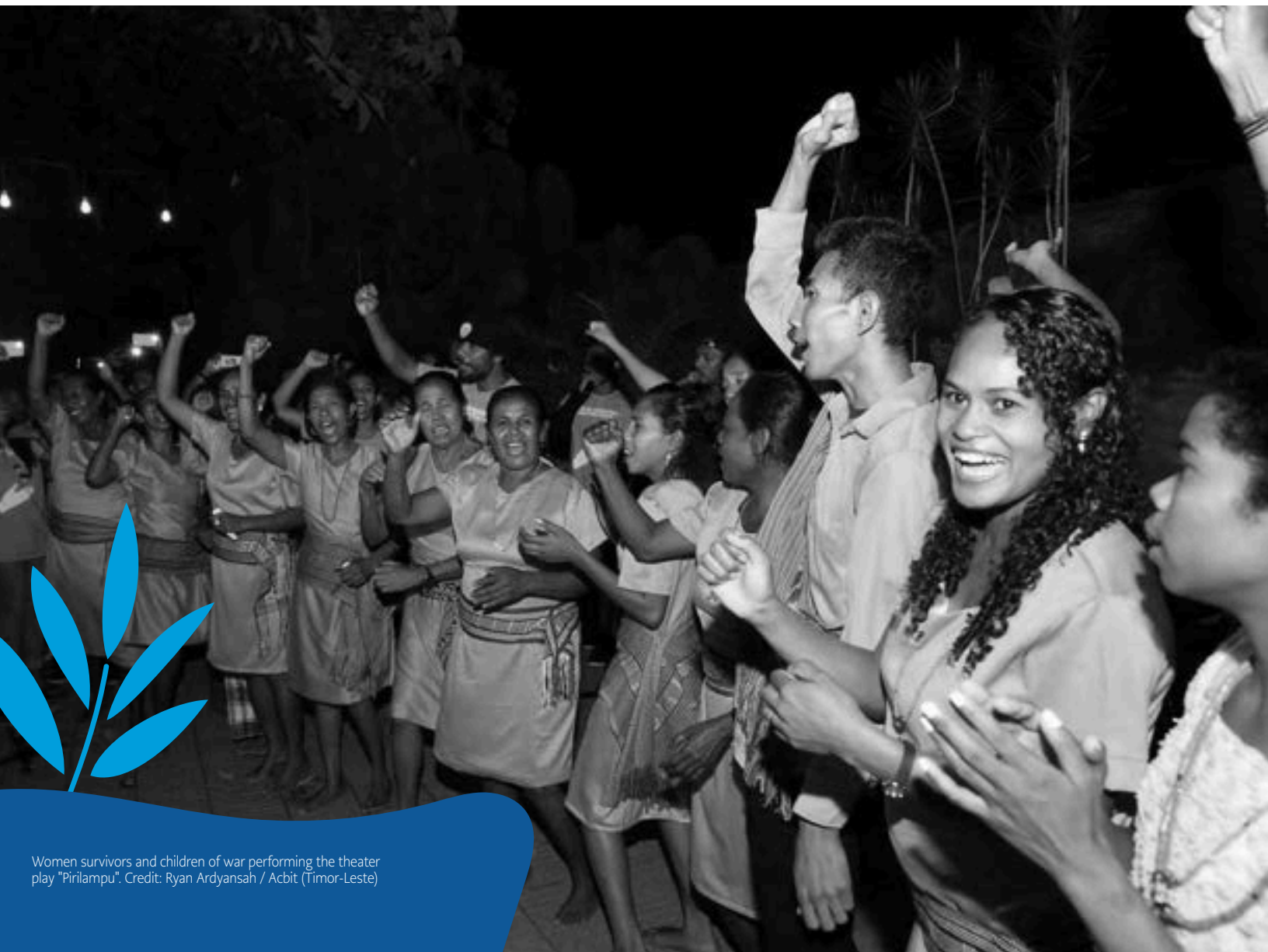
Women survivors and children of war performing the theater play "Pirilampu".