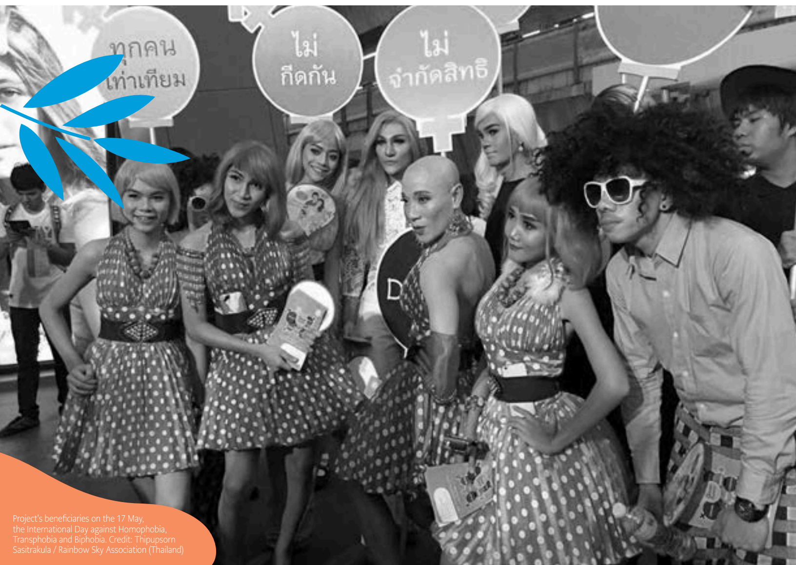
Project's beneficiaries on the 17 May, the International Day against Homophobia, Transphobia and Biphobia.

[W]e had to deliver a lot of content through digital platforms and had limited capacity. But now communications is one of our major teams, because much of the work has shifted online and so we had to invest into this digital platforms ... because we work in very remote areas ... we have a hybrid approach where some people can join on the live sessions, where they have [a] network [connection] and otherwise we put those things down into smaller videos which volunteers go to the villages and have meetings with three to five people and show the video and have a discussion ... we had a very steep learning curve on this (FGD, 23 November 2021).