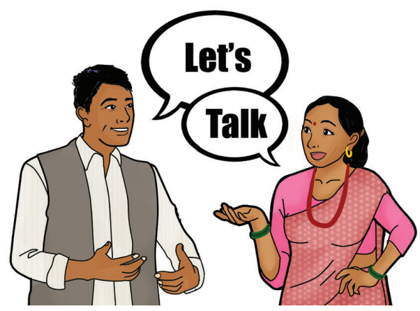
Illustration from the BIG Change Curriculum