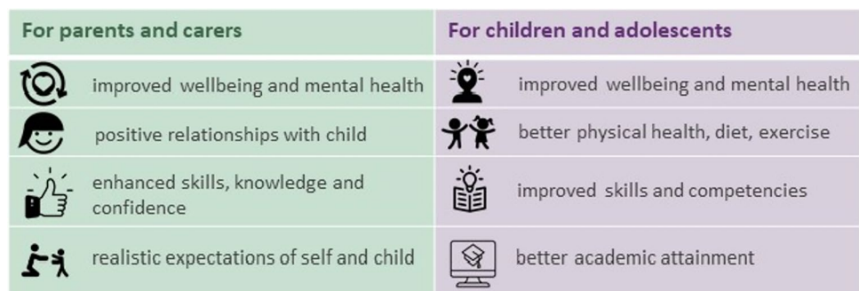
Fig. 2 Benefits of evidence-based parenting supports

or has occurred) where parenting deficiencies (i.e. risk factors for child maltreatment) are clearly apparent. This approach normalises parent education and support at the community level, an important factor for improving