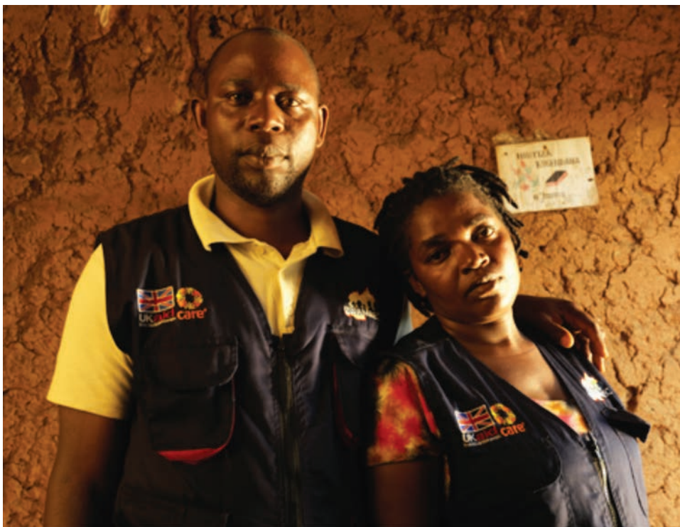
Community activist couple.

By the endline interviews with CAs however, this appeared to have shifted with CAs offering more spontaneous and informal forms of activism. The majority of CAs responded to regular requests to support individuals privately (i.e. home visits).