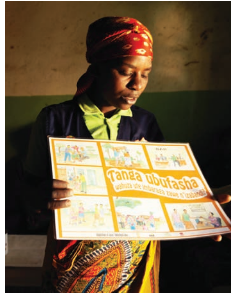
CA with an Indashyikirwa poster.

Several staff and CAs interviewed emphasized that the participatory, benefits-based approach was highly motivating for community members' engagement.