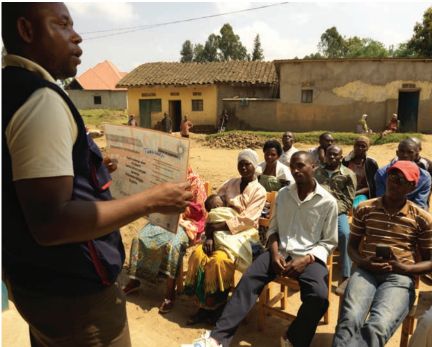
Description: An Indashyikirwa CA facilitating activism

C ommunity activism is increasingly being used as a strategy to shift harmful social norms, and ensure an enabling environment for preventing and responding to gender based violence. The Indashyikirwa programme in Rwanda equipped trained couples as community activists. This practice brief highlights the lessons learned from engaging couples as community activists as part of an IPV prevention programme.