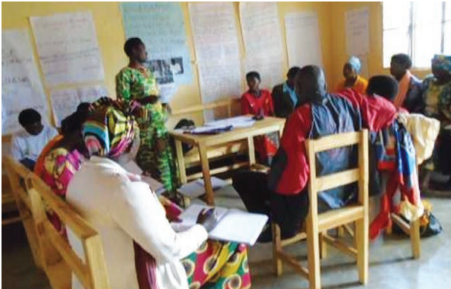
A group discussion as part of the couples' curriculum.

Intimate partner violence (IPV) is the most common form of violence against women, with an estimated one in three women having experienced partner physical or sexual violence in their lifetime. 1 The Indashyikirwa programme in Rwanda is an intervention that aims to prevent IPV and support healthy, equitable relationships through a participatory couples curriculum and community activism activities. The programme has been rigorously evaluated through research conducted with couples in the intervention. This practice brief highlights lessons learned from working and conducting research with couples to prevent IPV.