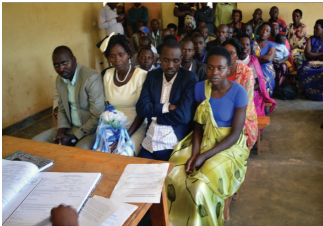
A sub-set of some of the trained couples who as a collective group legalized their marriages after the curriculum.

RWAMREC staff continued to meet with the trained couples for the duration of the programme, to support their relationships and community responses, including referral processes.