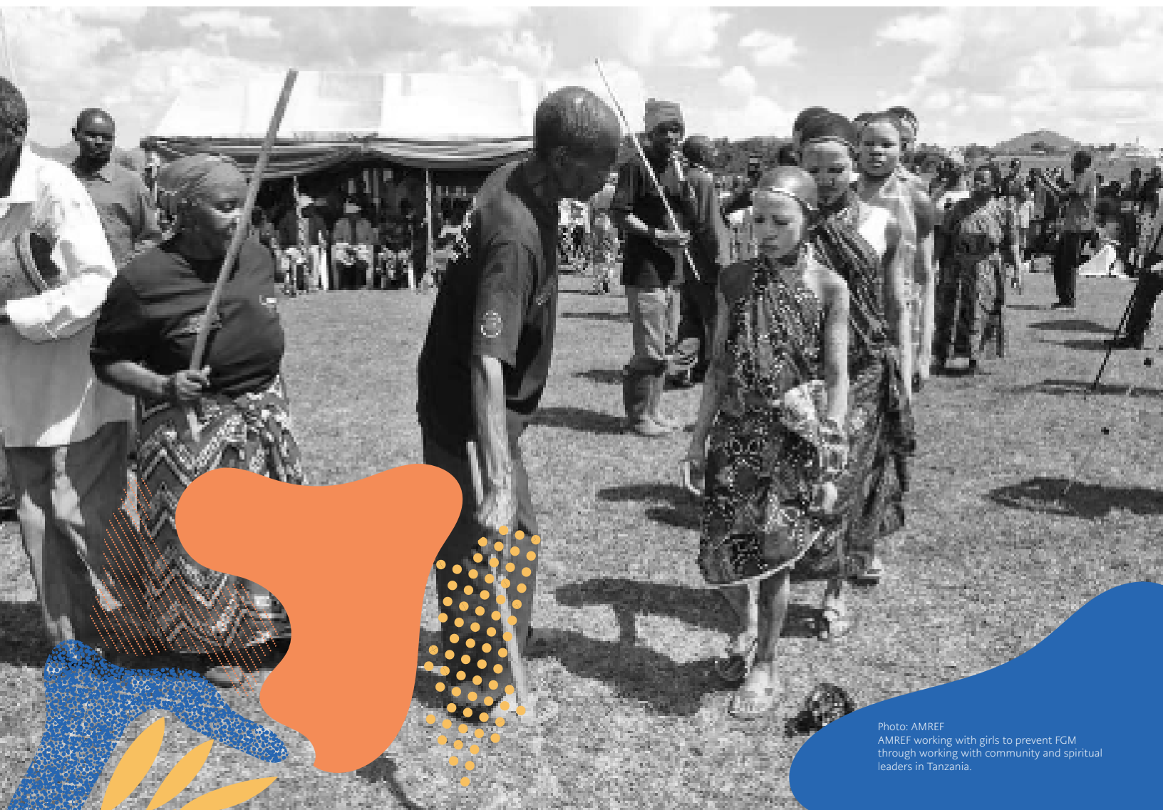
AMREF working with girls to prevent FGM through working with community and spiritual leaders in Tanzania.

The insights presented are based on the analysis of final external evaluations and project reports, and focus group discussions with CSO practitioners themselves. Through a qualitative, inductive approach, the authors put these insights from the 10 CSOs into conversation with existing literature on faith-based and traditional actors, to highlight how learning from practice can contribute to the evidence base on prevention of VAWG.