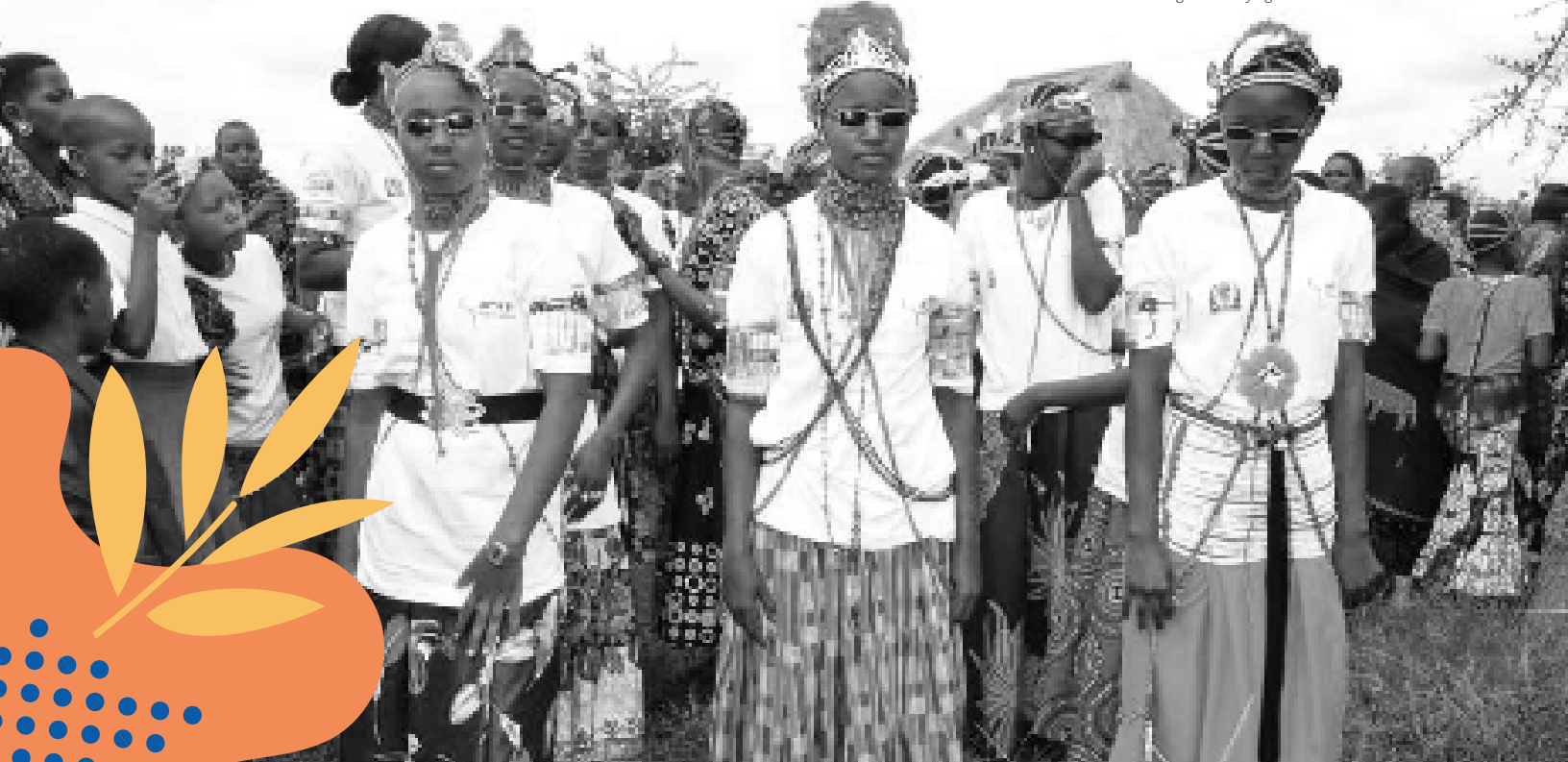
Girls during an activity against FGM in Tanzania.