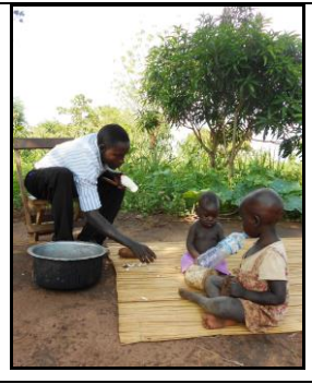
Redirect attention to something else (for example, another thing to play with)