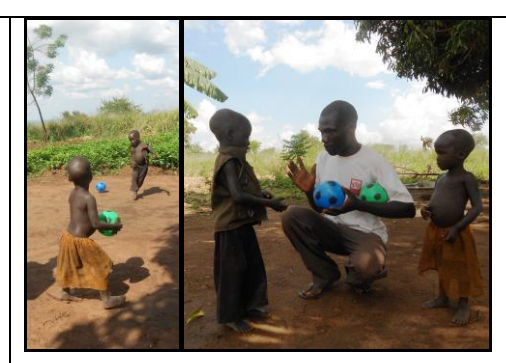
Remove or limit playtime after explaining the reason