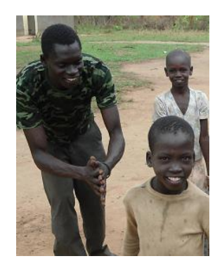
Praise your child