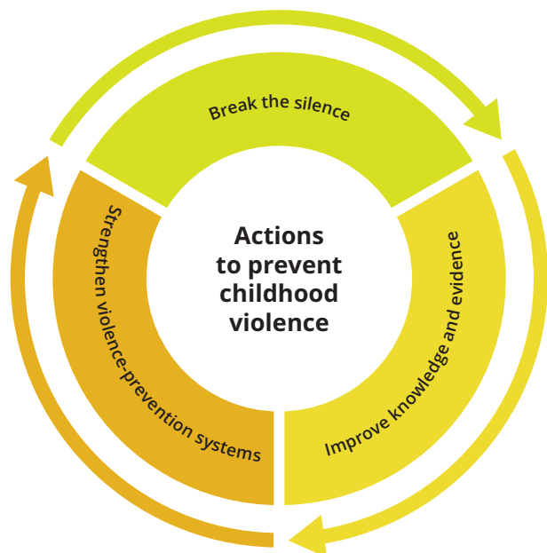
FIGURE 2: Actions to prevent childhood violence.

Broadly speaking, urgent actions to prevent childhood violence are needed along three critical fronts (FIGURE 2).