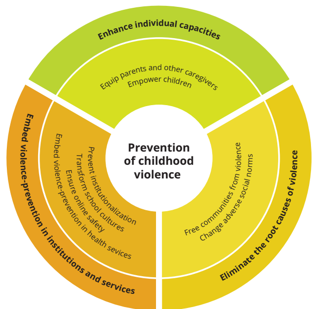
FIGURE 1: Prevention of childhood violence – a strategic framework.