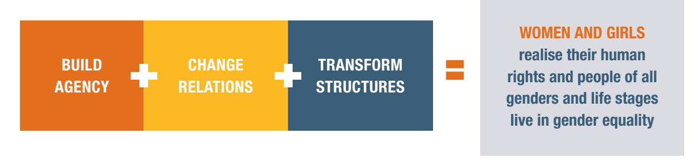
Figure 2: Theory of Change

The aim is to build agency of people of all genders and life stages, change relations between them and transform structures in order that they realise full potential in their public and private lives and are able to contribute equally to, and benefit equally from, social, political and economic development.